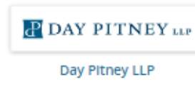
Day Pitney LLP