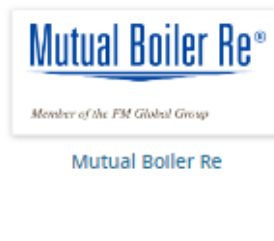
Mutual Boiler Re